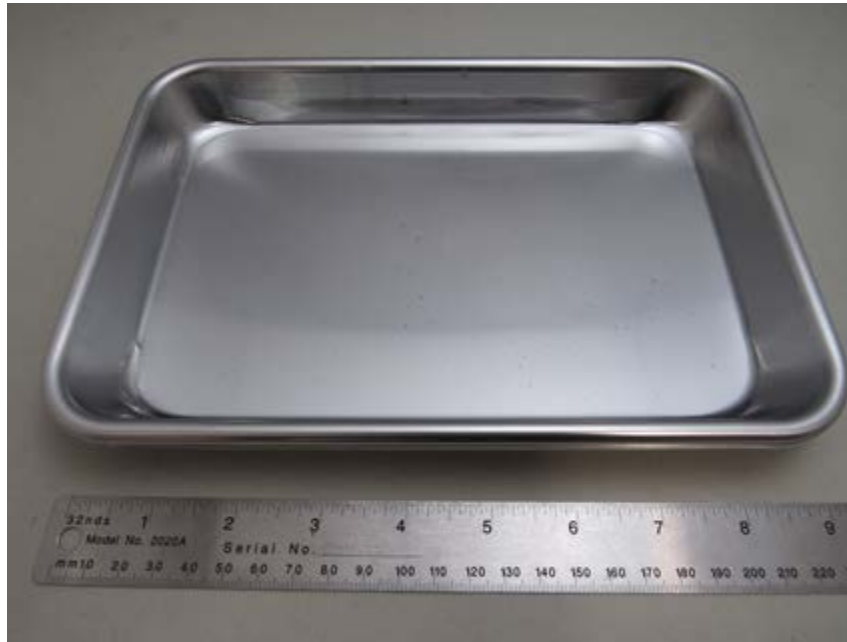
Photo Documentation – The product sample specimen is photographed immediately following specimen preparation and prior to initiating the conditioning period. Typically, the top and bottom faces of the specimen are photographed. Bottom faces may show a stainless-steel plate or other substrate if prescribed by the standard.