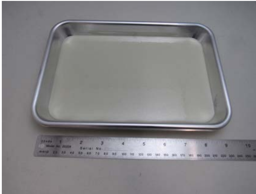
Photo Documentation – The product sample specimen is photographed immediately following specimen preparation and prior to initiating the conditioning period. Typically, the top and bottom faces of the specimen are photographed. Bottom faces may show a stainless-steel plate or other substrate if prescribed by the standard.