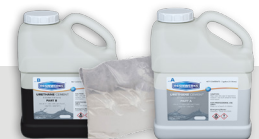
Bio-Cem TC™ polyurethane concrete topcoat matrix