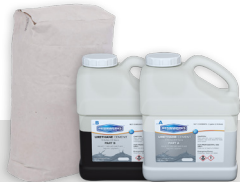
Bio-Cem™ SL self-leveling 1/8" broadcast to 3/16"