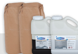
Bio-Cem™ CB 3/16" radius polyurethane concrete cove base