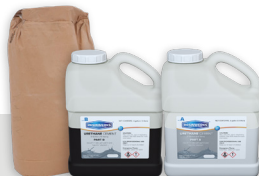
Bio-Cem™ MF Mono-Floor™ 3/16" broadcast to 1/4"